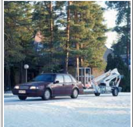
Lightweight design allows towing by a variety of vehicles.