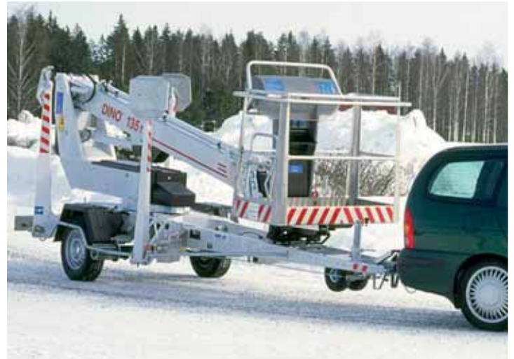
Easy towability of the DINOs is a concept.

DINO® and Dino Lift® are trademarks registered by the company Dino Lift Oy.