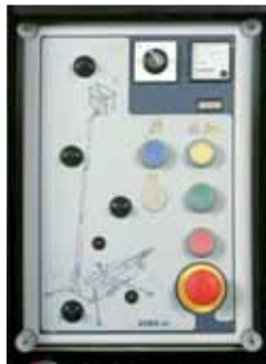
The control devices are uncomplicated.