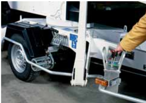
The ergonomic design enables easy use of the driving system.