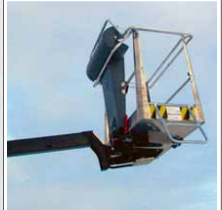
Cage rotation enables the cage to be accurately positioned.