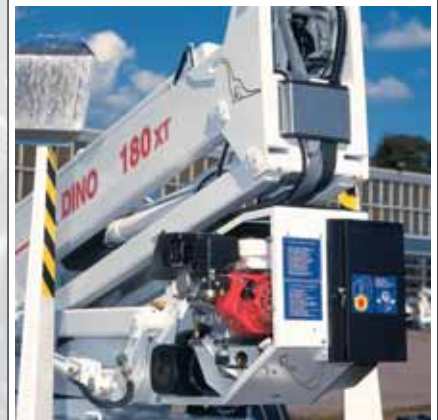
The platform may be fitted with an optional engine (Honda petrol or Hatz diesel).