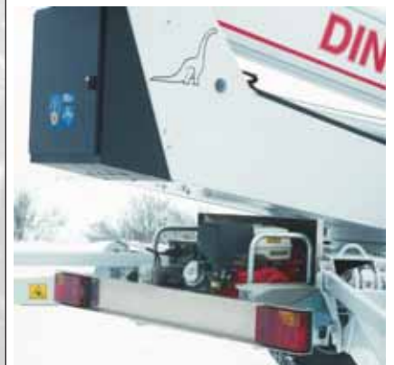
The petrol generator, provided as standard, produces power for both the platform and tools.

DINO® and Dino Lift® are trademarks registered by the company Dino Lift Oy.