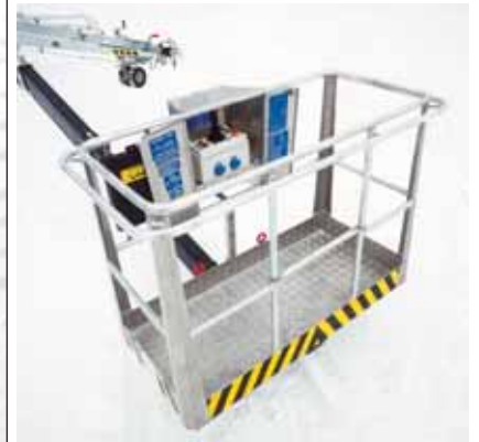
The basket of the DINO 230T is spacious. The boom movements may be controlled steplessly with one joystick.

The specification is subject to change without notice.