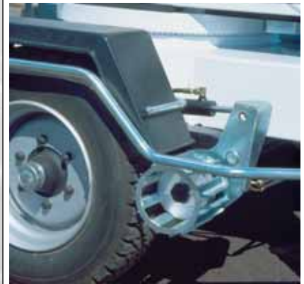
The drive mechanism enables the DINO 260XT to be moved easily around the job site. The system is switched on hydraulically.