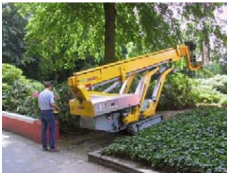
A gradeability up to 40% (21.8°) and a transport width of only 1.10 m reflect a high degree of manoeuvrability and user friendliness.