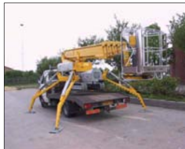
Transport on a small truck without a ramp.