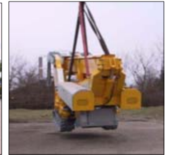
Lifting eyes are fitted.