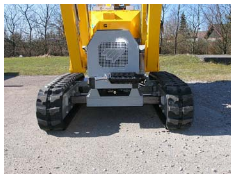
Optionally the lifts can be supplied with adjustable track width, hydraulically retractable from 1.50 m to 1.10 m.