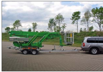
Transport on a purpose built trailer. Up to type 2200, the total weight is less than 3500 kg.