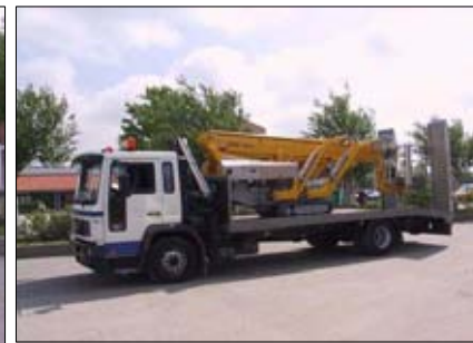
Transport on a truck with a ramp.