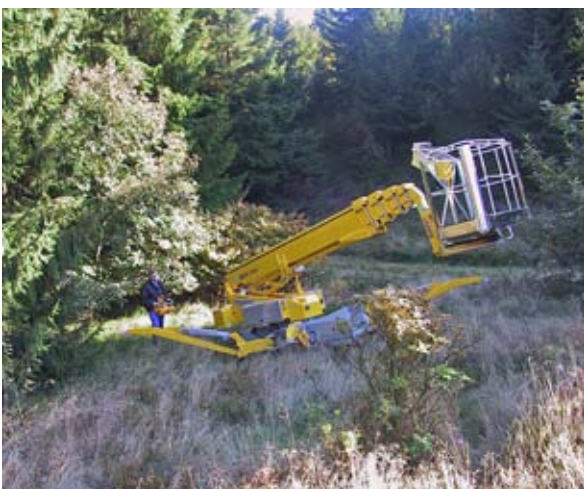
The tilt alarm sounds before the maximum incline is reached. Place the stabilizers in the wide position if there are any doubts regarding the gradeability.