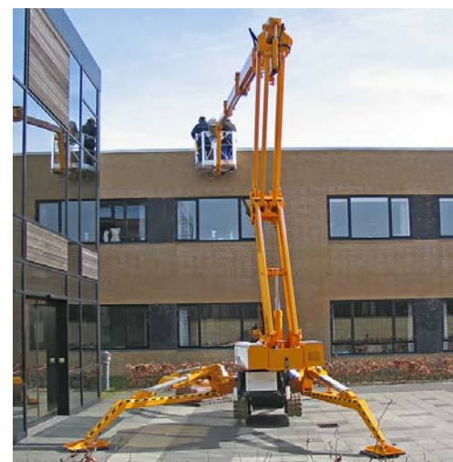
The operational width can be reduced by adjusting the stabilizer spread according to the required working envelope.