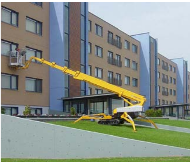
The telescopic boom enables the required working height to be achieved quickly and safely.