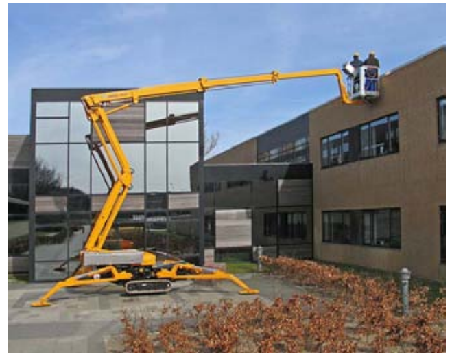
The combination of an articulating riser and a telescopic boom gives easy access up and over obstacles.