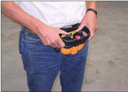
Drive operation: Standard via wired remote control. Optional wireless control.