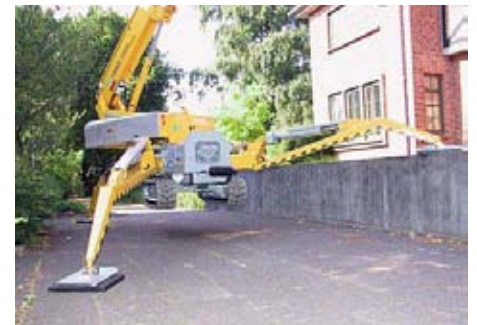
The specially designed stabilizers provide quick and easy set up on slopes of up to 40% (21.8°).