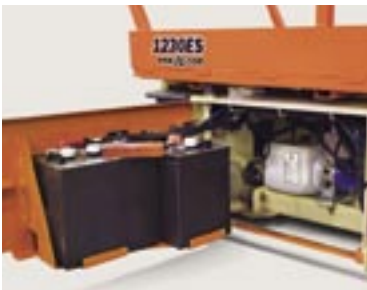
All-steel swing-out battery doors with heavy-duty hinges.