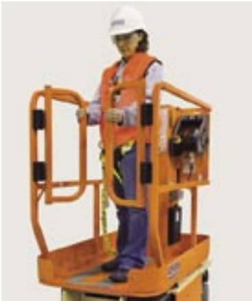
Saloon-style swing gate for ease of entry and exit.