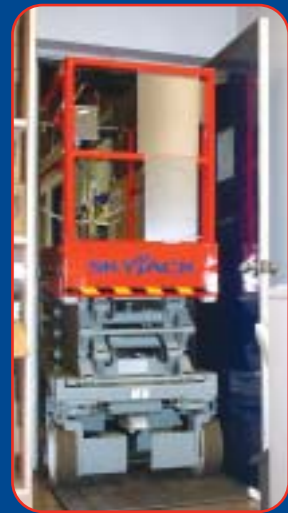
Overall Compact dimensions permit access through standard doorways.

The Compacts provide exceptional versatility for those tight spots where agility and maneuverability make all the difference. With work heights up to 7,6m, up to a 227kg capacity and 23% gradeability, the SJIII Compacts offer big performance in small spaces.