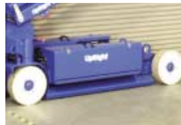
Hydraulic depression mechanism system activates when platform is elevated.