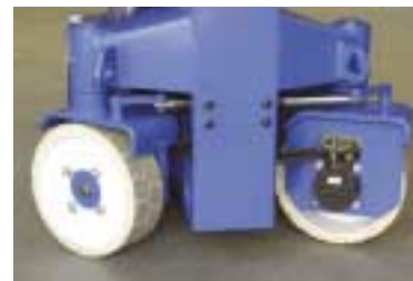
High angle steering for excellent manoeuvrability.