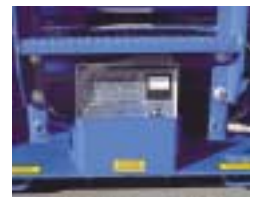
Easily-accessible rear-mounted battery charger allows operation during charging. Swing out modules allow access to all service components in seconds, encouraging regular maintenance.