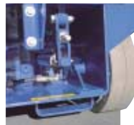
Non-marking tyres are fitted as standard to protect floor finishes.