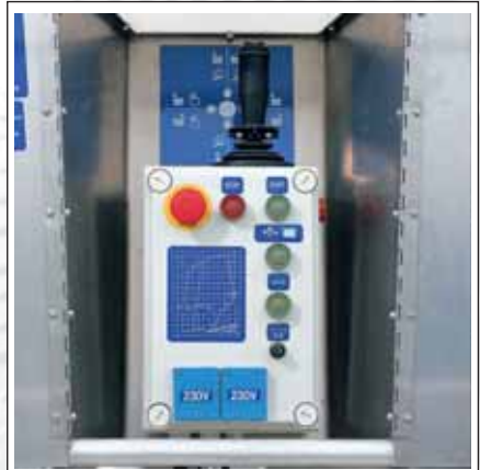
A fully proportional joystick control allows smooth operation.