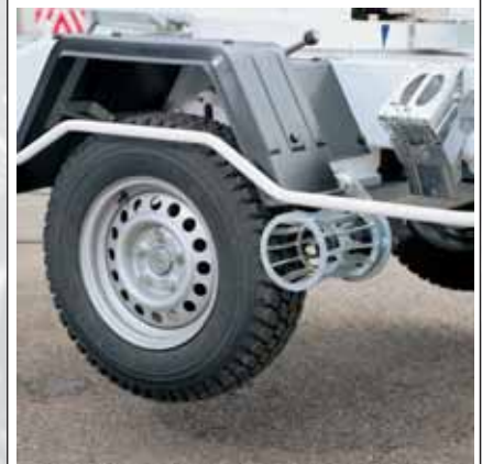
The hydraulic drive system, provided as standard, allows the DINO 180T to be easily manoeuvred around site.

DINO® and Dino Lift® are trademarks registered by the company Dino Lift Oy