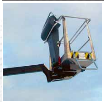
Cage rotation enables easy positioning of the cage.

DINO® and Dino Lift® are trademarks registered by the company Dino Lift Oy.