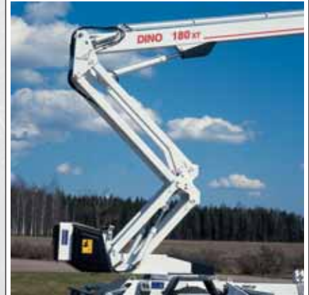
The articulated riser accounts for the excellent up-and-over capability.