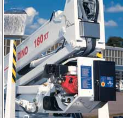
The platform may be fitted with an optional engine (Honda petrol or Hatz diesel).