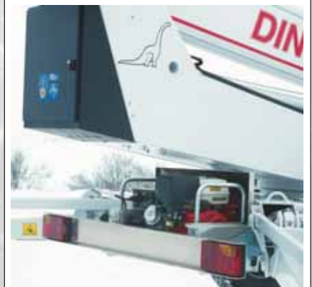
The petrol generator, provided as standard, produces power for both the platform and tools.

DINO® and Dino Lift® are trademarks registered by the company Dino Lift Oy.