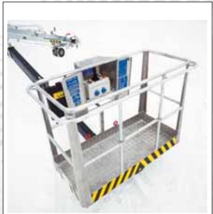
The basket of the DINO 230T is spacious. The boom movements may be controlled steplessly with one joystick.

The specification is subject to change without notice.