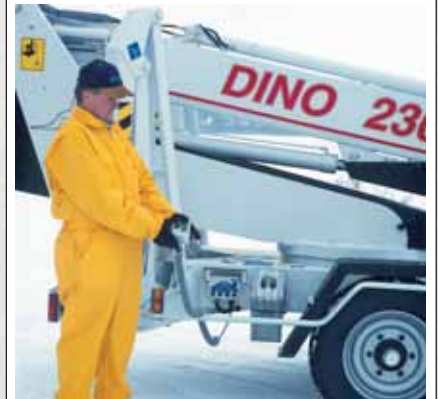
The driving system of the DINO 230T may be operated either with the push buttons on the chassis or with the cable control available as an option.