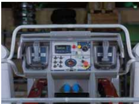
All driving and boom functions are operated from the well-designed panel.

The specification is subject to change without notice.