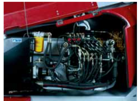
Maintenance of the modern and reliable hydraulic & control systems is easy.

DINO® and Dino Lift® are trademarks registered by the company Dino Lift Oy