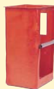
Narrow Fiberglass Platform

The Gated Narrow, Front Entry Gated Narrow and Front and Side Entry Extra-Large are not pictured. The Gated Ultra Narrow, Front and Side Entry Extra-Large, Standard Fiberglass and Narrow Fiberglass Platforms are not available with the Outreach option.