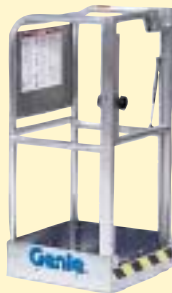
Gated Ultra-Narrow Aluminum Platform