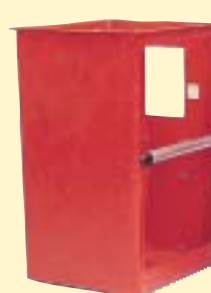
Standard Fiberglass Platform