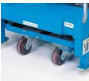
Foot pedal raises the base for easy maneuverability.