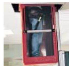
The Narrow Fiberglass platform is the smallest fiberglass platform available.