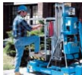
The Genie IWP gives you the lowest entry height in its class.*