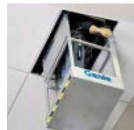
The Gated Narrow platform easily fits through ceiling tiles.