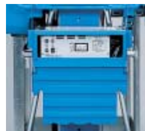
Removable Battery Box.