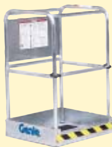
Standard Aluminum Platform

The 27 x 26 in (69 x 66 cm) sliding mid-rail entry platform is the largest standard sized platform in the industry. Excellent for general purposes, it is included with Standard and Wide Base models.