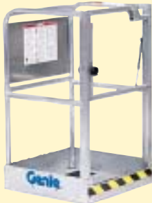
Gated Standard Aluminum Platform