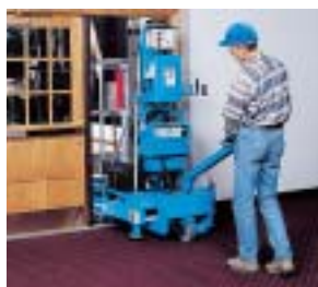
Power Wheel Assist option.