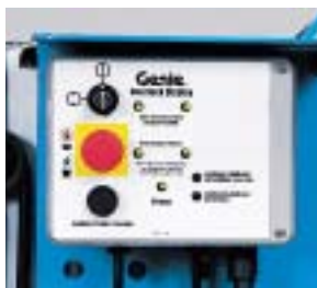
Ground Controls include a low-battery indicator.