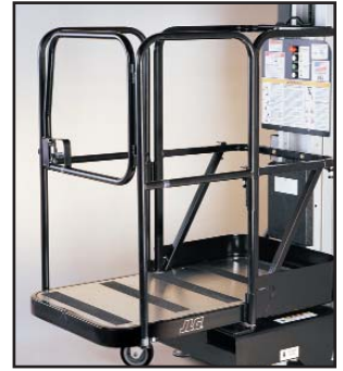
Flexible platform rail set up for efficient retrieval of materials.

When you want efficient and safe access to shelving and materials, JLG Model 12SP and 15SP Stock-Picker lifts are the perfect choice. They feature large platforms, high capacities of 500 lb (227 kg), and working heights up to 21 feet (6.40 m) without the need for outriggers.