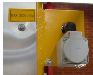
230 V outlet in basket