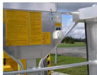
230 V outlet in basket