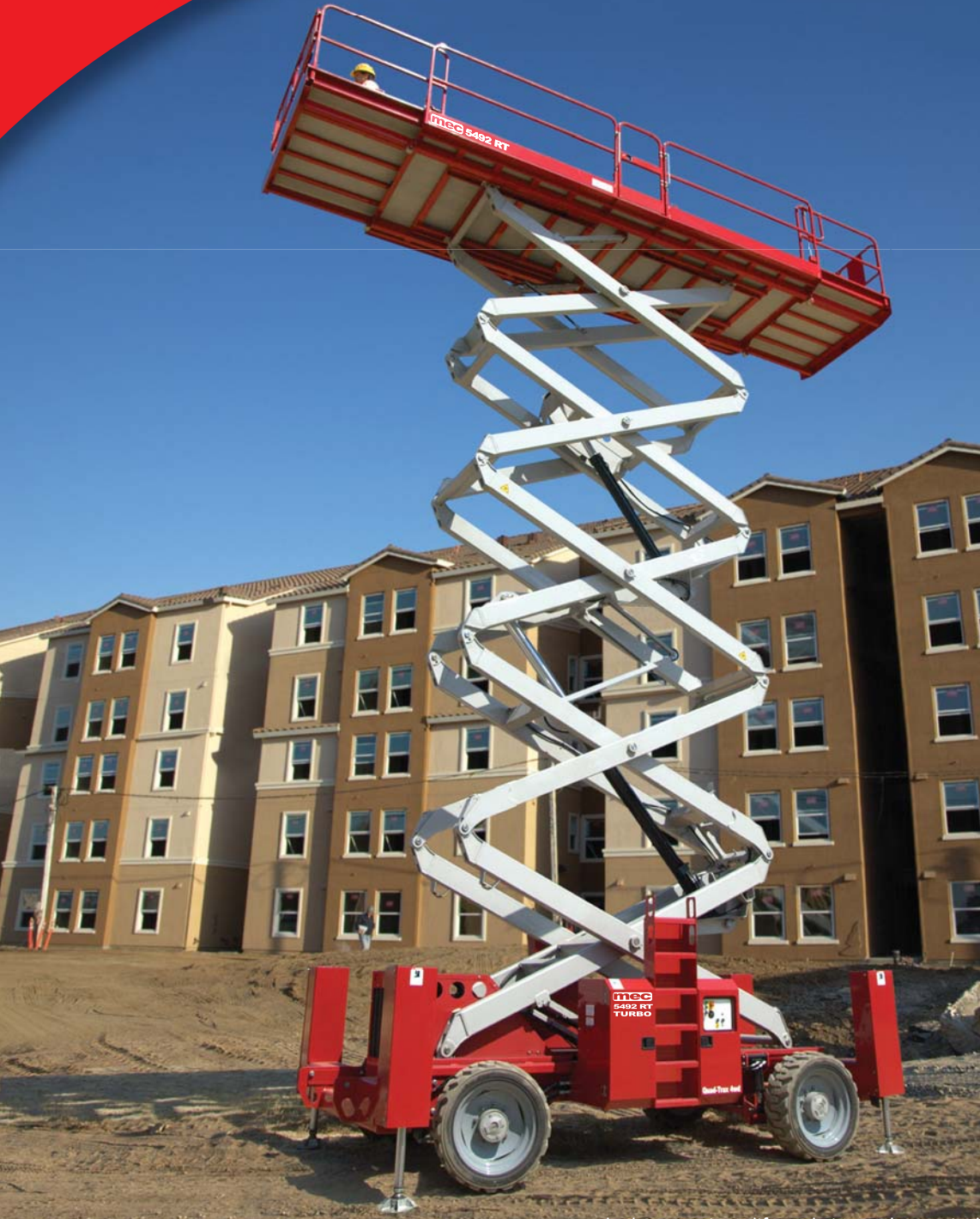
The largest scissor lift made in North America!