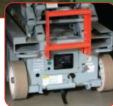
Charger at rear of base offers unrestricted access