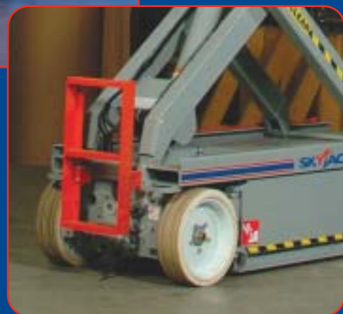
SJIII Conventionals feature variable speed rear wheel hydraulic drive.