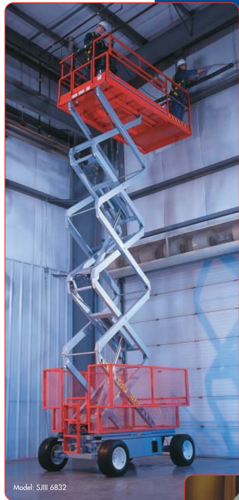
Model: SJIII 6832

The Conventionals offer high capacity, large platform areas, battery power and joystick proportional control for drive/lift functions. With working heights up to 11,6m, 25% gradeability and load capacities up to 590kg, Conventionals are suitable for any on-slab application.