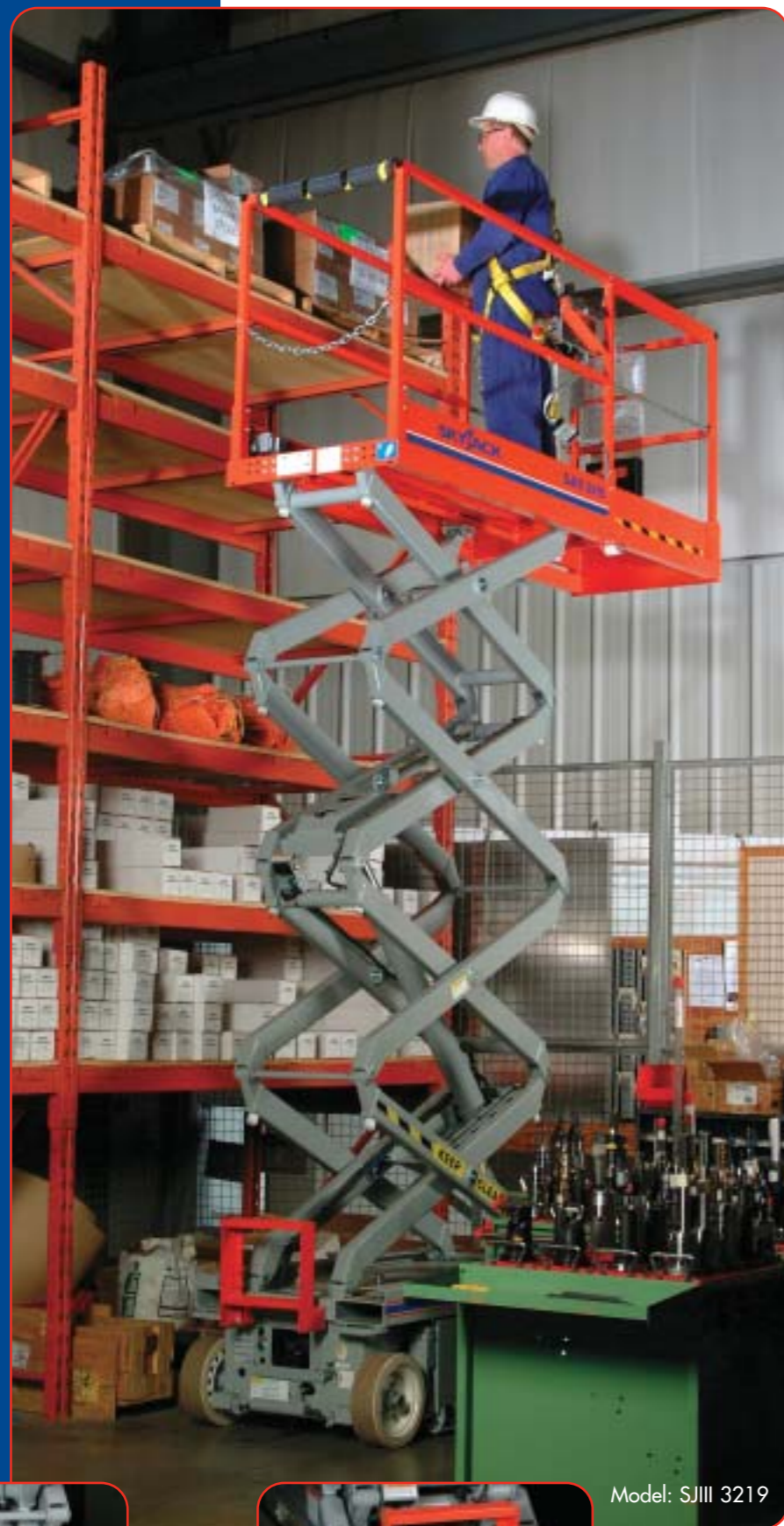
Model: SJIII 3219

Both Compact models feature variable speed front wheel hydraulic drive.